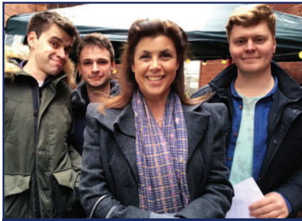
The group with host, Kirstie Allsopp

Three Old Whitgiftian pupils appeared on Channel 4's Location, Location, Location on 13th September.