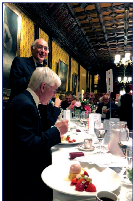
Lord Michael Howard delivers his speech

This year's Whitgiftian Association Annual Dinner, hosted by WA President, Lord David Freud, was a splendid affair with 120 OWs of all generations in attendance. The event was held at the historic Peers' Dining Room.