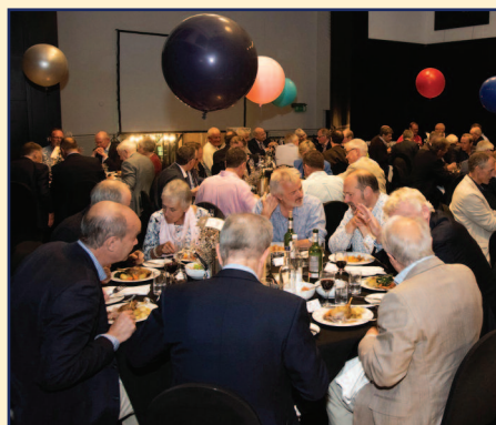
From left to right, Dodd's, Andrew's, Brodie's, Ellis's, Cross's, Mason's, Smith's and Tate's, represented by coloured balloons